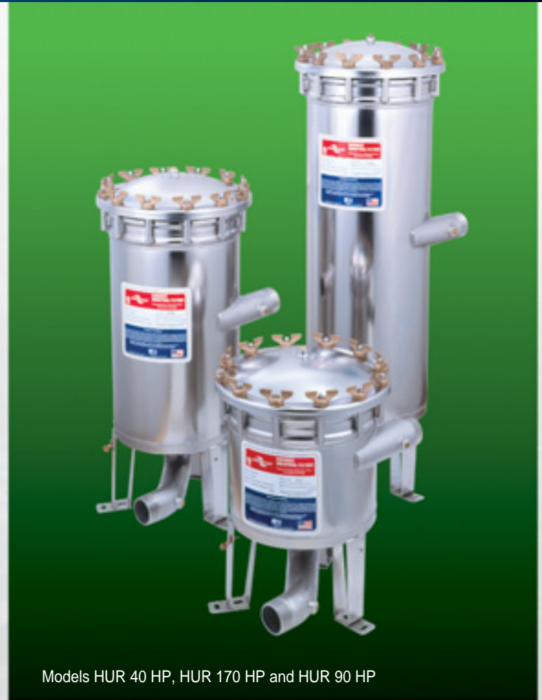
Models HUR 40 HP, HUR 170 HP and HUR 90 HP