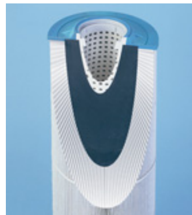
Hurricane A/C cartridge