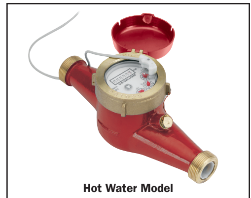
Hot Water Model